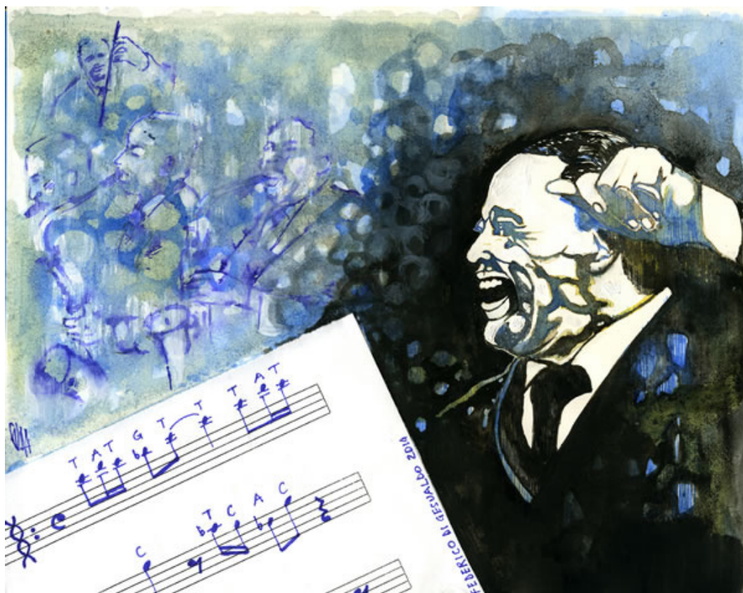
Figure 3: LncRNAs orchestrate the “diminuendo” and “crescendo” of cellular functions. Duke Ellington was probably the greatest conductor, composer and arranger in jazz history. His longtime friend and colleague Billy Strayhorn once said: “Ellington plays piano. But his real instrument is his orchestra. Each member of his orchestra is to him a distinctive tone color and set of emotions, which he mixes with others equally distinctive to produce a third thing which I like to call the Ellington Effect” [199]. One of Ellington’s most important compositions is “Diminuendo and Crescendo in Blue”: the title refers to expression marks that mean decreasing or increasing the sound in volume. The conductor controls the elements of musical expression (tempo, dynamics, articulation) as lncRNAs orchestrate and modulate gene expression and cellular functions.

Research over the last two decades has illuminated the complexity of the transcriptome and led to the detection of many lncRNAs. While it is still valid to assume that proteins are the effectors of cellular processes, new roles for RNA have begun to emerge; several lines of evidence indicate that lncRNAs play important roles in the control of gene expression and the maintenance of cellular functions. The balanced expression of these