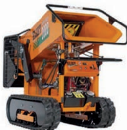
Figure 14. Eliet – Super Proof 2000 – Shredder. Allows to chip the waste from eight hours of pruning in one hour and it is easily maneuvered past all garden entrances and gates thanks to the tracks.