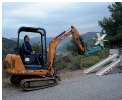
Figure 20. Viviani – Combers.