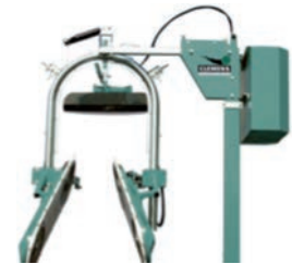
Figure 10. Clemens – Shoot binder tandem - The shoots are tied in synchronization with the driving speed. With good soil conditions, working speeds up to 7 km/h are possible. With three-dimensional adjustments, the shoot binder can be adapted to suit various types of vines and conditions in the vineyard.