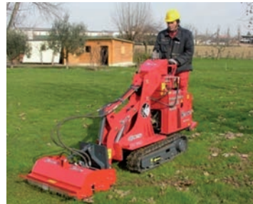
Figure 6. Hinowa – HS 1200 Compact track tractor with guidance on the footboard. The most important characteristics are the roadway with variable pitch from 76 to 106cm and the electric and hydraulic arrangement for mounting various agricultural kit.