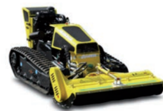
Figure 17. Energreen - Robogreen - , Brushwood shredder machines. Allows to work on slopes up to 50°, and the remote control ensures the complete security of the workers.