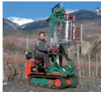
Figure 7. Clemens - Pre-pruner vario. The pre-pruner is designed to adapt to the working conditions of each vineyard. Each cutting head is driven through its own hydraulic circuit.