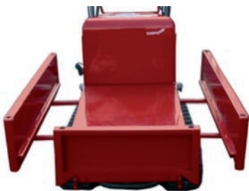
Figure 3. Sabre Italia – Mini crawler dumper – Bp 30. Dump with expandable sides- Dimension: Length 75 cm (90) - Width 53 cm (83) - Height 21 cm.