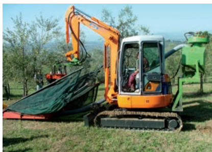
Figure 19. The integrated yard. The head shaker and the reverse umbrella on the front and the cleaner system on the back.

The recovery of the olives is a crucial aspect, very often overlooked. The machines for intercepting are essentially aimed to the rationalization of the yard collection and the reduction of costs through an increase in labor productivity. In fact, the recovery represents a considerable part in the times and costs of collection, in particular in such areas. There are interesting solutions, the automatic umbrellas able to facilitate and optimize the recovery operations. There are manual versions, even for very small economic reality olive-growing (Figure 21), and motorized, for the reduction of efforts while traveling in the field; also placed on the mini-track tractor for more professional business. All