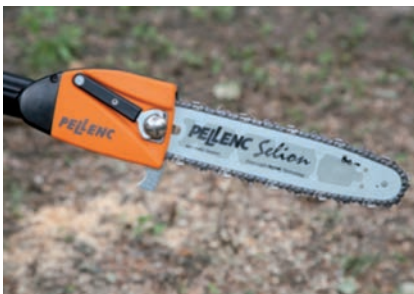
Figure 13. Pellenc – Selion – Electric chainsaw.

An innovation in the field of weed control is represented by the