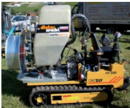
Figure 4. Ro.Da.G – Mini crawler tractor – HT 200 – The tank contains 25l, max flow rate 24l/m.