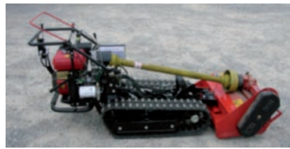
Figure 5. Fratelli Camisa - TP 480H Crawler tractor with guidance from the ground and power takeoff.