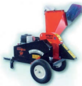
Figure 15. Bear Cat – Chipper 4.5”.