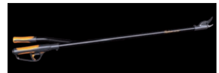
Figure 11. Pellenc – Trelion - Electronic scissors.