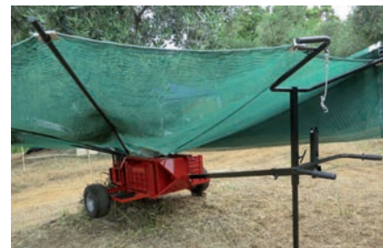
Figure 21. Bosco.-Olivspeed. The manual umbrella is a revolutionary solution for the recovery of the olives and it is available with a diameter of 4, 5 and 6 meters.