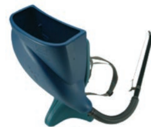
Figure 18. Simeoni - Fertil Dispenser – Knapsack. Allows an operator to fertilize uniformly from 600 to 1500 plants per hour.