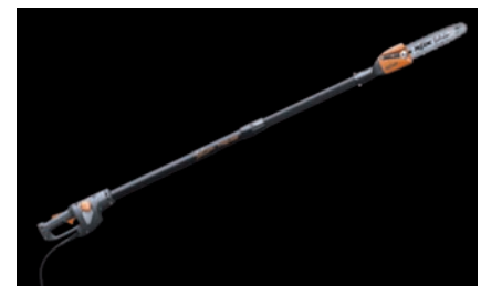
Figure 12. Pellenc – Selion – Electric chainsaw applied on a telescopic pole. Allows cutting branches thick over 30cm, up 5 m in height. It is also possible tilt the head up to 90°. All the Pellenc gears are powered by lithium-ion battery, which is characterized by the high autonomy offered and the possibility of being applied equally on each of them.