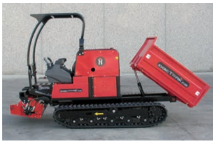
Figure 2. Hinowa – Mini crawler tractor D.O.C. Track 37.100. Equipped with brushwood shredder, pneumatic tipping dumper, prepared to use the atomizer.