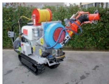
Figure 16. Martignani - Phantom B 748 “Minor-Trekker” - Nebulizer cannon.