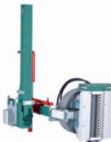
Figure 8. Clemens - EL 30 - Leaf remover - Due to the weight and reduced dimensions, it is possible to use even in tight rows, and can also be worn by a mini-track tractor. The vine leaves are drawn in between a rubber roller and a perforated drum by a suction fan, removed from the vine and ejected from the machine. Thanks to a parallelogram joint, the leaf remover glides gently over the grape area.