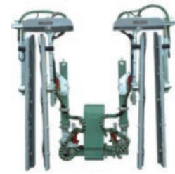
Figure 9. Clemens – Leaf cutter - Thanks to special manufacturing techniques, the aluminium blade holder of the leaf cutter is itself very strong and yet very light. This increases its stability and makes it possible to work on steep slopes and gradients. The sickle-shaped cutting tools made from tempered knife steel produce a clean cut. The large upper blade is surrounded by a guard that prevents the driver from being exposed to the cuttings. Thanks to special drive belts, the device is very low maintenance. The blade holder has vibration-free bearings, and the impact protection works at both front and back.