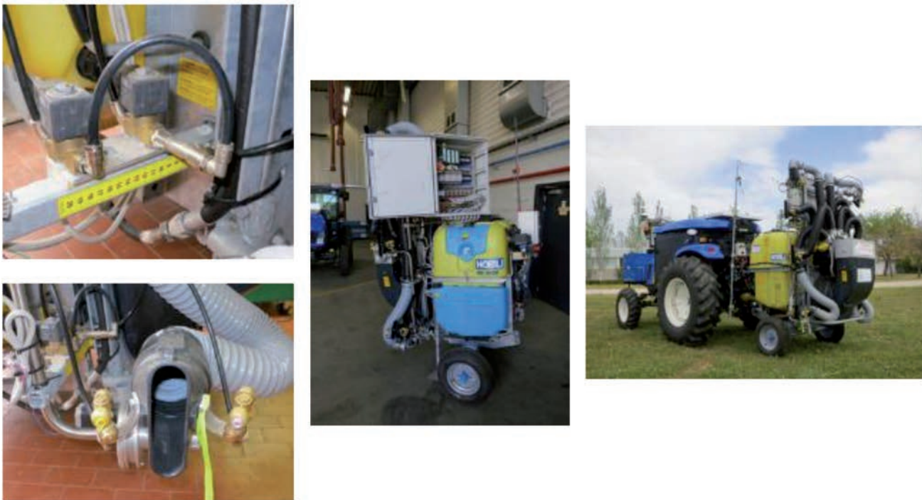
Figure 5. On the left solutions developed for the liquid flow rate control: dual nozzles on each module electronically controlled by two solenoid valves with 70% and 30% of needed flow rate on each band simultaneously open with full canopy. Centre: electronic plant, center of the low level actuation system. On the right general view of the RHEA air blast sprayer prototype coupled with the ground mobile unit.