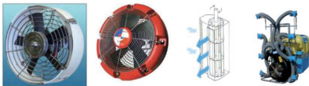
Figure 2. Spraying and air vector devices solutions evaluated for the air blast sprayer configuration: left to right; the Propotec rotary atomizers which use mechanical centrifugal force to atomize fluids; The Sardi fan Multiple air-assisted sprayers, with a series of spray heads with a direct blast axial flow fan and a series of hollow cone nozzles; The tangential cross-flow fan; The Nobile Oktopus sprayer with eight spraying modules manually adjustable.