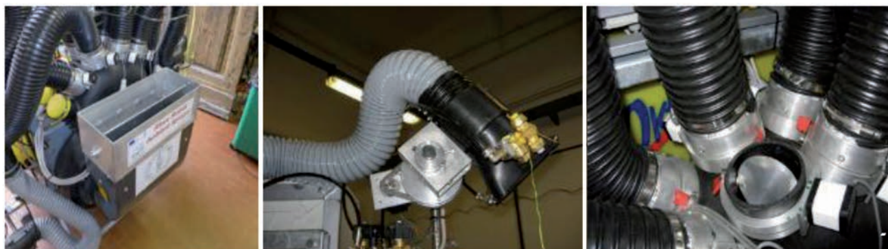
Figure 4. Devices developed for the air flow control left to right: fan inlet manifold throttle valve in the main entrance; actuation system for the upper and lower spray modules based on kinematic coupling driven by the stepper motor. This solution allows to obtain 30 ° of rotation, thus the orientation of air flow; butterfly valves located on the exit of fan calotte to selective opening of the spray modules.