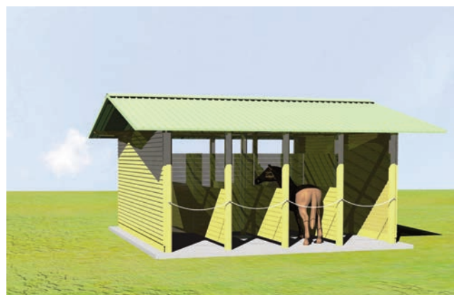
Figure 4. Perspective view of the temporary stay horse shelter.