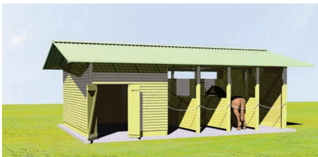
Figure 2. Perspective view of the overnight stay horse shelter.