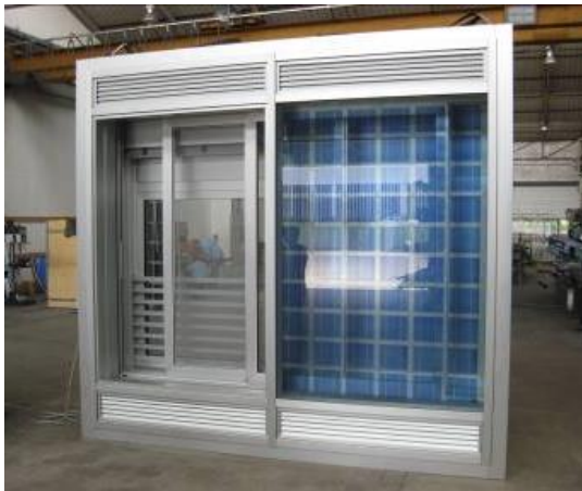
Figure 1: Smart Facade. Prototype with PV panel

The shading device made with mobile and metallic lamellae or with terracotta tiles, allows regulating the light and minimizing the glare phenomena.