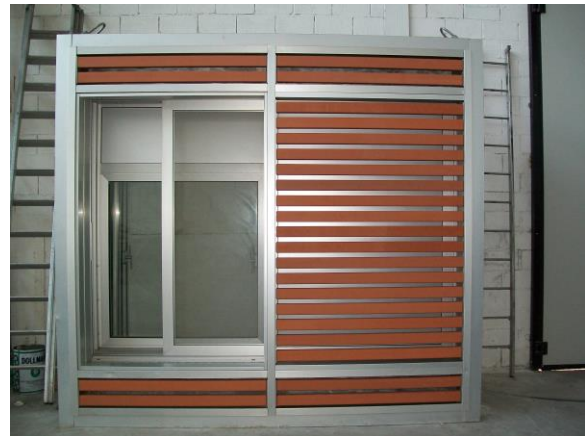
Fig. 2. Smart Facade. Prototype with Brick panel

We have realized two prototypes of this type of dynamic facade: