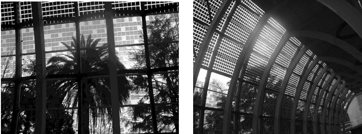
Figure 3: The PV plant integration in the greenhouse

So such a solar shading system is able to provide the inner space with very pleasant shade in summer: as cells are placed in the upper part they can guarantee a good protection from high summer rays without interfering with low winter solar radiation. This system also aids the filtration and modulation of daylight, lowering its fastidious glaring effects during summer (fig.3).