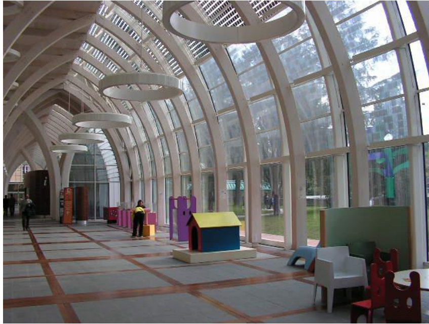
Figure 3: View of greenhouse's interior