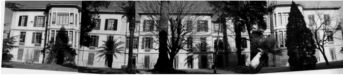
Figure 1: The building before the refurbishment

administration office of the new adjacent Paediatric Hospital, The Meyer Hospital, that increased in the extended area of the Medical Scientific University Pole of Careggi in Florence (fig. 1).