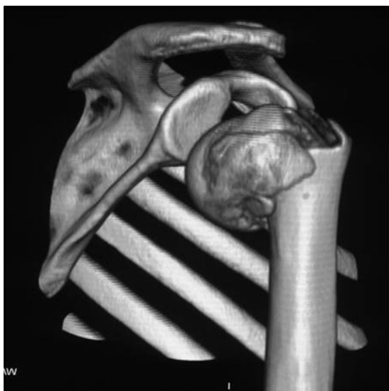
Fig. 2. CT scan shows marked rotation and varus dislocation of humeral head.

In cadaveric specimens, Chow et al. showed how fibular allograft augmentation could increase the strength of the locking plate to withstand repetitive varus loading. None of the augmented