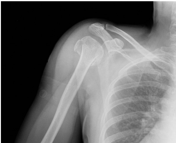
Fig. 1. Anteroposterior X-ray projection of the shoulder in a 68-year-old female with Neer four-part fracture.

humeral fractures with locking plate and fibular allograft augmentation. We found recovery of good clinical results in all patients, no collapses of humeral head or screw penetration of the articular surface and healing of the fracture with no change in humeral head height between X-rays taken postoperatively and at the final follow-up.