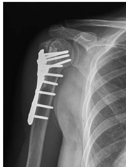
Fig. 4. Anteroposterior radiograph of shoulder at 2 years post-op shows healing of the fracture, no change in humeral head height.

The limitations of our study are as follows. First is the use of two different surgical approaches and two types of locking plate.