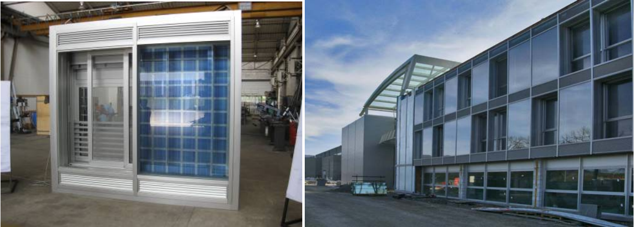
Figure 4. (a,) Details of the photovoltaic integrated facade. (b) Photovoltaic atrium integrated roof from inside