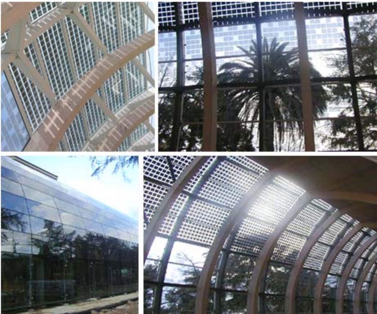
Figure 1. (a,b,d) Few details of the photovoltaic integrated roof from inside. (c) Detailed face, external view.

Other innovative elements and materials in Meyer Children Hospital include: