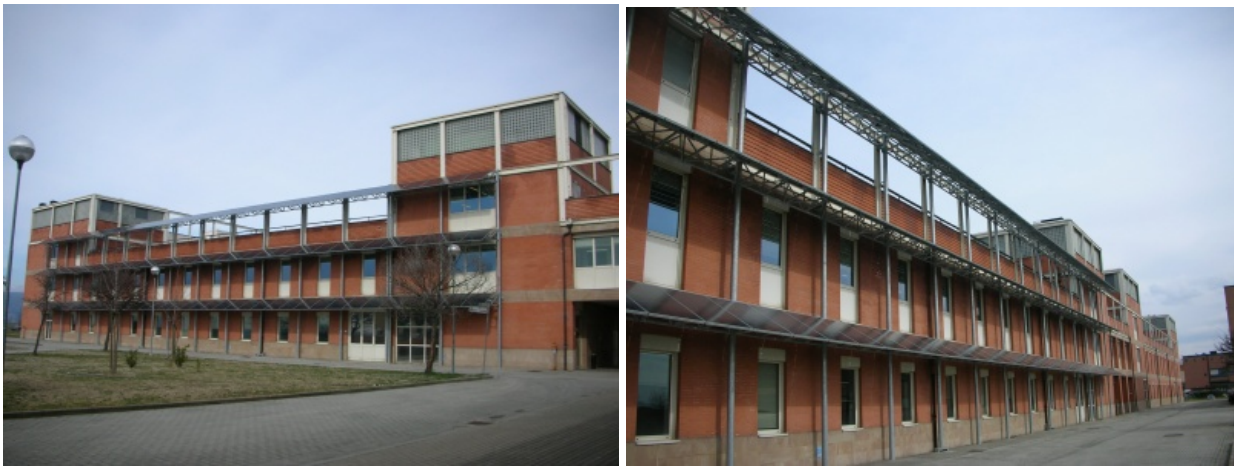
Figure 7. (a,) View of the shading devices integrated in the façade (b) Detail of the structure

The 3 subsystems are realised by 60, 54 e 74 photovoltaic modules divided in variable strings from 9 to 12 modules.