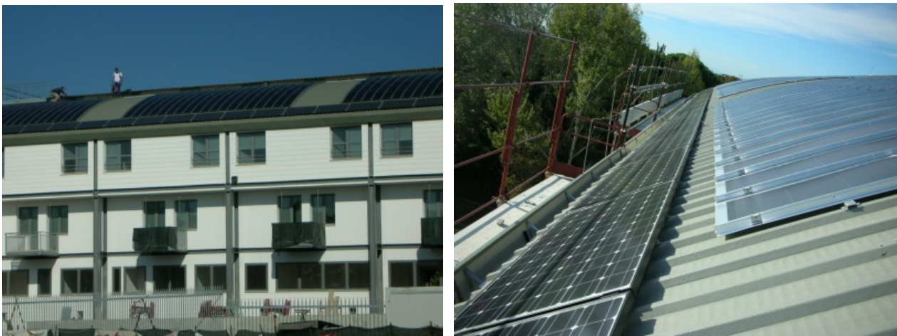
Figure 8. (a., b) View of roof with the two PV systems, thin film and monocrystalline modules

The plant type is grid-connected and the connection mode is "in-phase low voltage." The power plant is equal to 19.92 kWp, and the estimated production of 21 320 kWh of energy per year (minimum value to ensure), derives from 94 amorphous silicon modules occupying an area of approximately 220 m 2 and 34 silicon modules monocrystalline occupying an area of 44 m 2 approx., power, respectively: - 12.784 kWp - 7.14 kWp.