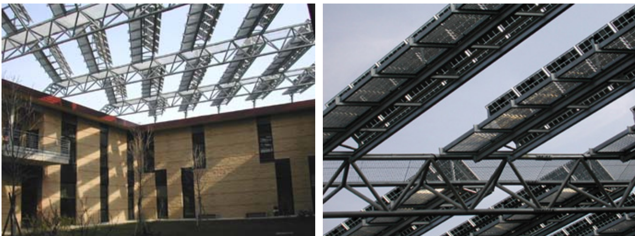
Figure 5. (a,) Details of the photovoltaic integrated structure of shading devices. (b) Photovoltaic shading devices

Photovoltaic modules are 35° tilted and south oriented. The electricity produced in DC current by PV modules will be fed, after conversion into alternate 400 V and 50Hz, into the building grid connected to the Medium Voltage Distribution National Grid. The energy produced will be measured through a proper meter, installed by the grid manager and accounted under the directive n° 224/00 by the National Energy Authority. System production