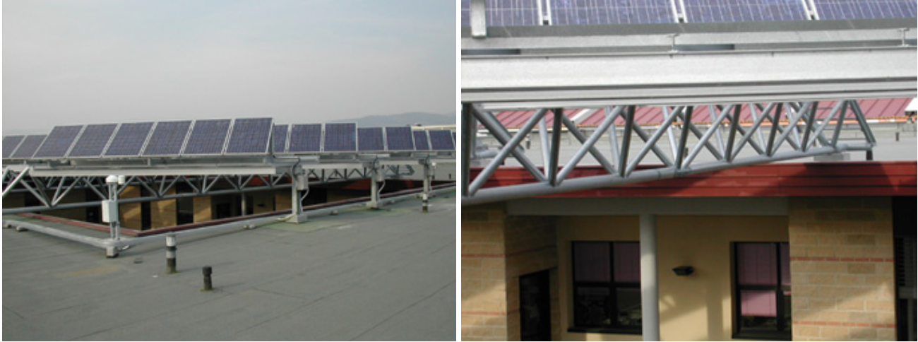
Figure 6. (a,) View from the roof (b) Detail of the structure

The system has a completely automatic operation and it doesn't require any help for the regular functioning. During the first hours of the day, when it is reached a reasonable quantity of radiance on the plane modules, the PV system automatically begins to pursue the point of maximum power to maximize power from the PV field.