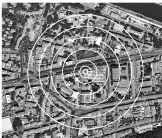
Fig. 2 - Circles of different size centred on sensor site (10 m, 25 m, 50 m, 100 m, 150 m, 200 m and 250 m radius)

For each site, GCR (percentage of green area of type L and T) was calculated on circle area of radius varying from 10m to 250m (Fig. 2). Lawn cover area (LCR) and tree cover area (TCR) were also computed applying separately the same procedure on green areas of type L and T.