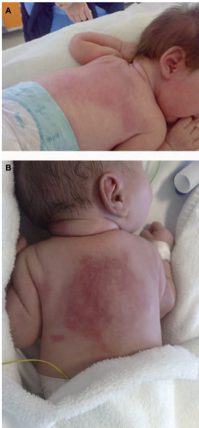
Figure 2. Subcutaneous fat necrosis. Erythematous and indurated plaques on the back of (a) patient 1 and (b) patient 2 after direct contact with the cooling blanket.

The high incidence of SFN in infants exposed to hypothermia has recently suggested that “cold stress” could play an important role in its pathogenesis [20]. SFN has been described in newborns following hypothermia when abandoned on the street [21] or exposed to cold weather [22]. Moreover, cases of SFN have been observed in newborns treated with applications of ice bags for supraventricular tachycardia [23–26], or subjected to whole-body cooling before being placed on cardiopulmonary bypass for cardiovascular surgery [27–30]. Neonates have an increased risk of developing SFN due to the different composition of fatty acid concentrations. It has been postulated that the higher percentage of the saturated to unsaturated fats ratio in the brown fat of newborns