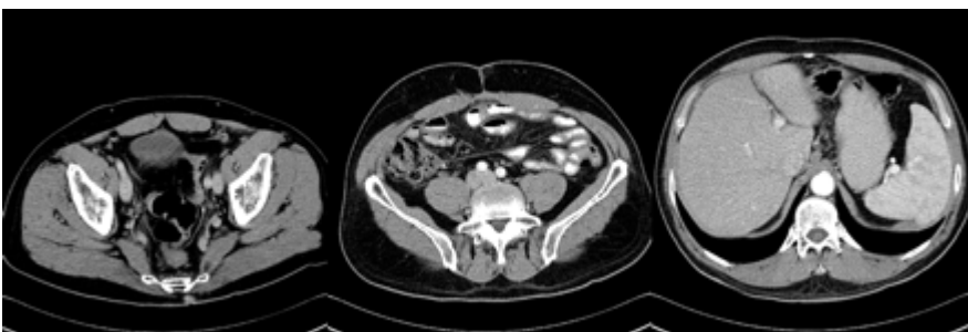
Figure 2 Axial contrast enhanced CT images, acquired after 9 months of treatment with cotrimoxazole and ceftriaxone, show complete resolution of ascites and thickening of the peritoneum.

At the time of discharge, bowel function was regular, blood count was almost normal and the patient had gained 6 kg. At 3 and 6 months follow-up, the patient was healthy, with no clinical or ultrasound signs of ascites. An abdominal CT scan performed after 12 months confirmed the absence of ascites and peritoneum thickening ( fig 2 ).