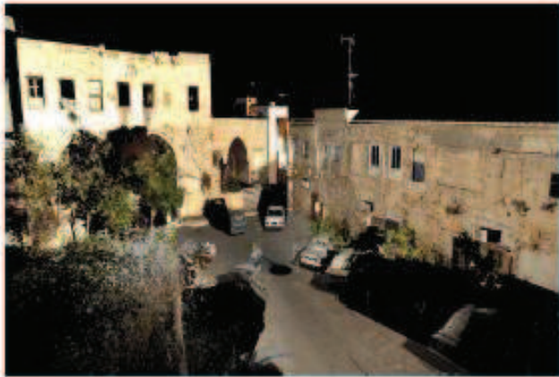
Fig. 7: 2D Image of the total texturing point cloud model of the Promenade archeologique in Tyre, Lebanon