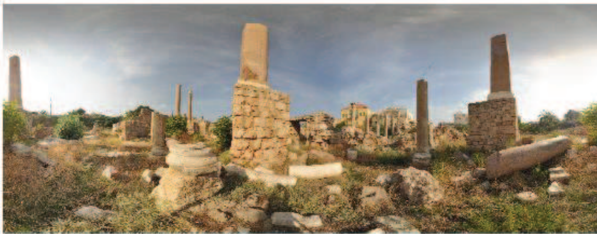
Fig. 8: Panoramic image of the archeological area in Tyre, Lebanon