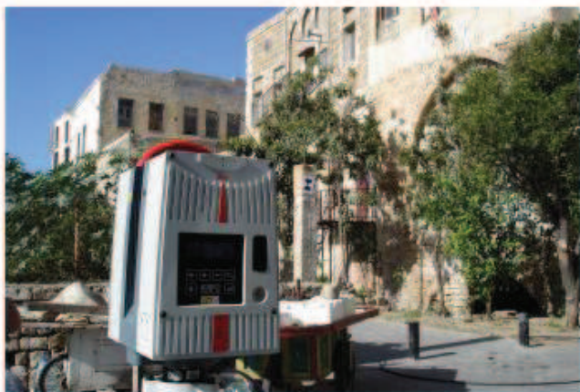
Fig. 5: Laser scanner surveying of the Promenade archeologique in Tyre, Lebanon