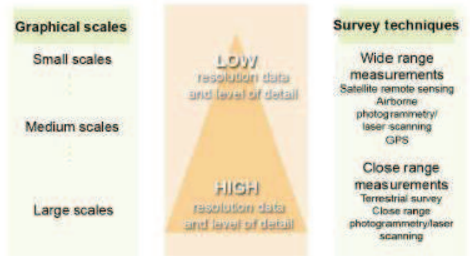
Fig. 3: Pyramid scheme showing relations between graphical scale, data resolution, and level of detail.