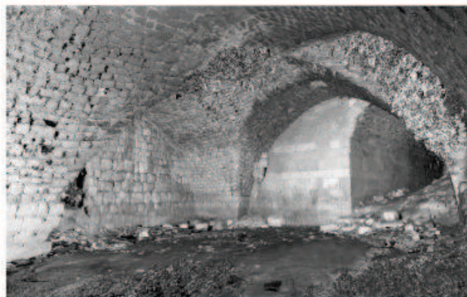
Fig. 6: 2D image of the total points model of the Systems of Gallery of the old city of Tartous, Syria

Rapid acquisition on-site is important when distance and inaccessible sites make long survey campaigns both difficult and expensive. Among the factors influencing the choice of instruments used in Syria and in Lebanon were portability and operational autonomy. A total station, a digital camera, and a laser scanner were used. (Fig. 5)