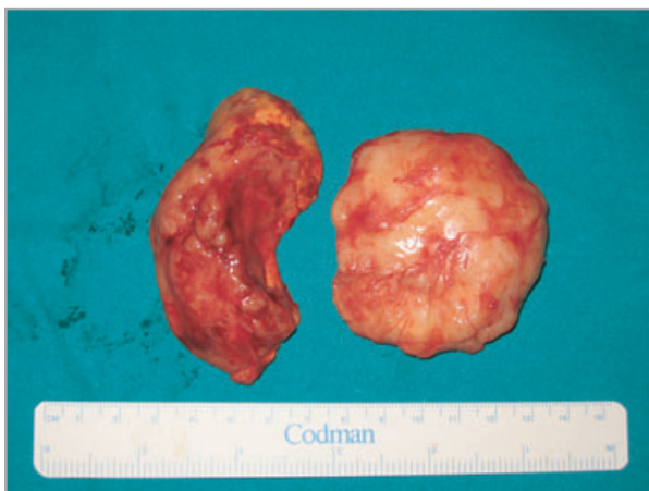
Fig 2. The mass was easily excised thanks to a well-defined cleavage plane. Macroscopically, it presented as a two yellow compact masses.