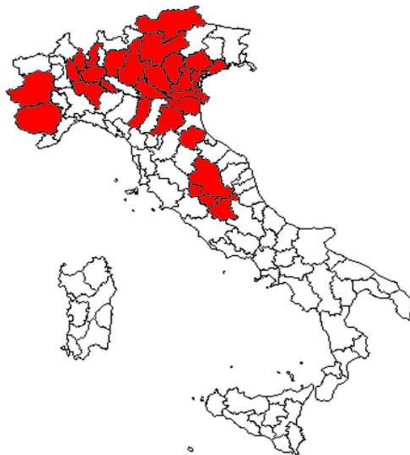
Fig. 6. Distribution in Italy of the non-indigenous crayfish Orconectes limosus

Finally, C. destructor and C. quadricarinatus seem to be still confined to experimental farms in central and northern Italy, while the marbled crayfish Procambarus sp., a parthenogenetic species and consequently potentially highly evasive, can easily be purchased in Italy from aquarists even through the commerce through internet. However, a reproductive population of C. destructor has been recently recorded in the Natural Reserve of "Laghi di Ninfa" in the Province of Latina (Scalici et al. 2009b) and at least a specimen of the marbled crayfish has been signalled in Tuscany (Foiانو della Chiana, Province of Arezzo) within an abundant population of P. clarkii (Nonnis Marzano et al. 2009).