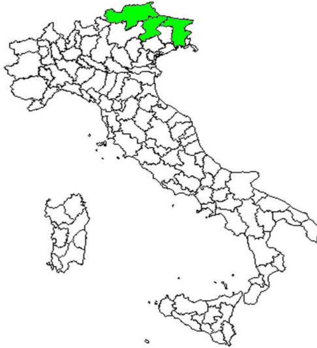
Fig. 2. Distribution in Italy of the indigenous crayfish Astacus astacus