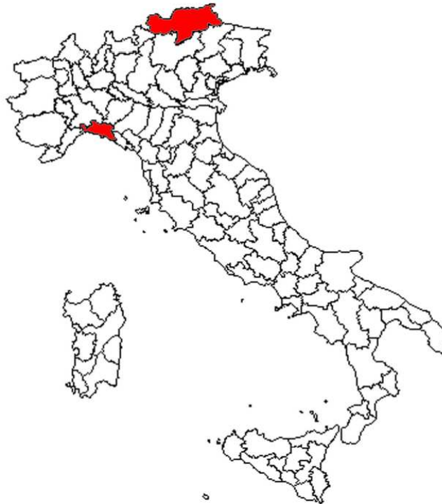
Fig. 8. Distribution in Italy of the non-indigenous crayfish Pacifastacus leniusculus