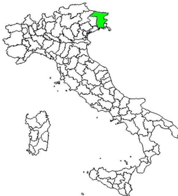
Fig. 3. Distribution in Italy of the indigenous crayfish Austropotamobius torrentium