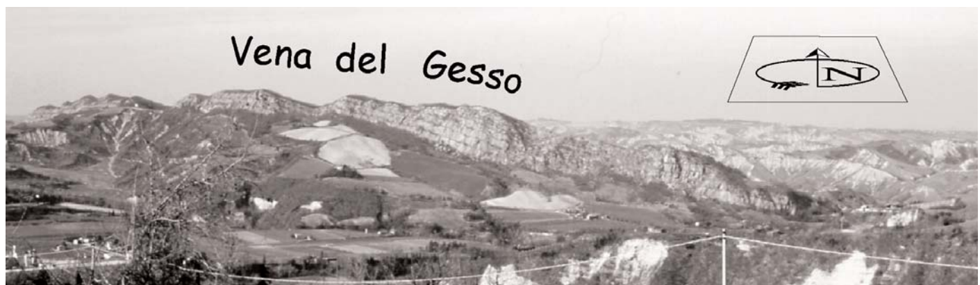
Fig. 1 - Panoramic photograph showing the characteristic appearance of the Vena del Gesso monocline.

Moreover, the experimental results evidence the major role played by syntectonic erosion that dictated the deformational style. This is illustrated by two models (VdG04 and VdG 05) sharing the same initial set-up, velocity of deformation and bulk shortening, but erosion was applied to the internal sectors of model VdG-04 only. The comparison of top view photographs and cross sections (fig. 3) between the two models highlights that model VdG-04 developed a quite different structural architecture in respect to the other (model VdG05), thus