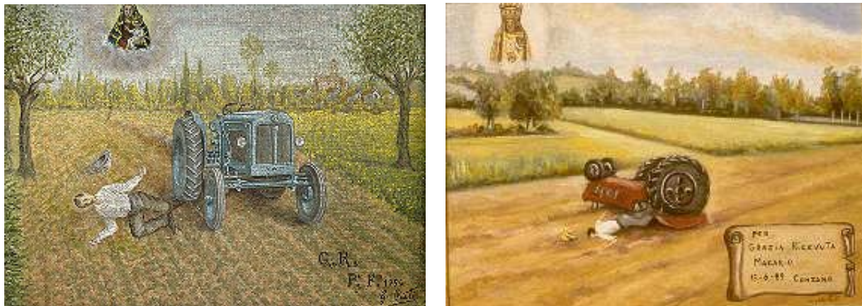
Figure 1. Accidents and risks in agricultural machinery use have always been well known as represented in the ( ex voto ) exposed all over in Shrines. But this know-how is no longer owned by the new farmers who work occasionally without experience and with often old and not reliable machinery.

Risk level is increased by many factors: low information on machine or plant works; use of material, machine and process unsuitable for the specific work or situation; low training on the correct drive and behaviour in the specific situation; lack of correct procedures in agricultural machine use; fixing machine components; lack of correct maintenance; being careless, tired, in a hurry, having too much confidence with machines . (Figure 1)