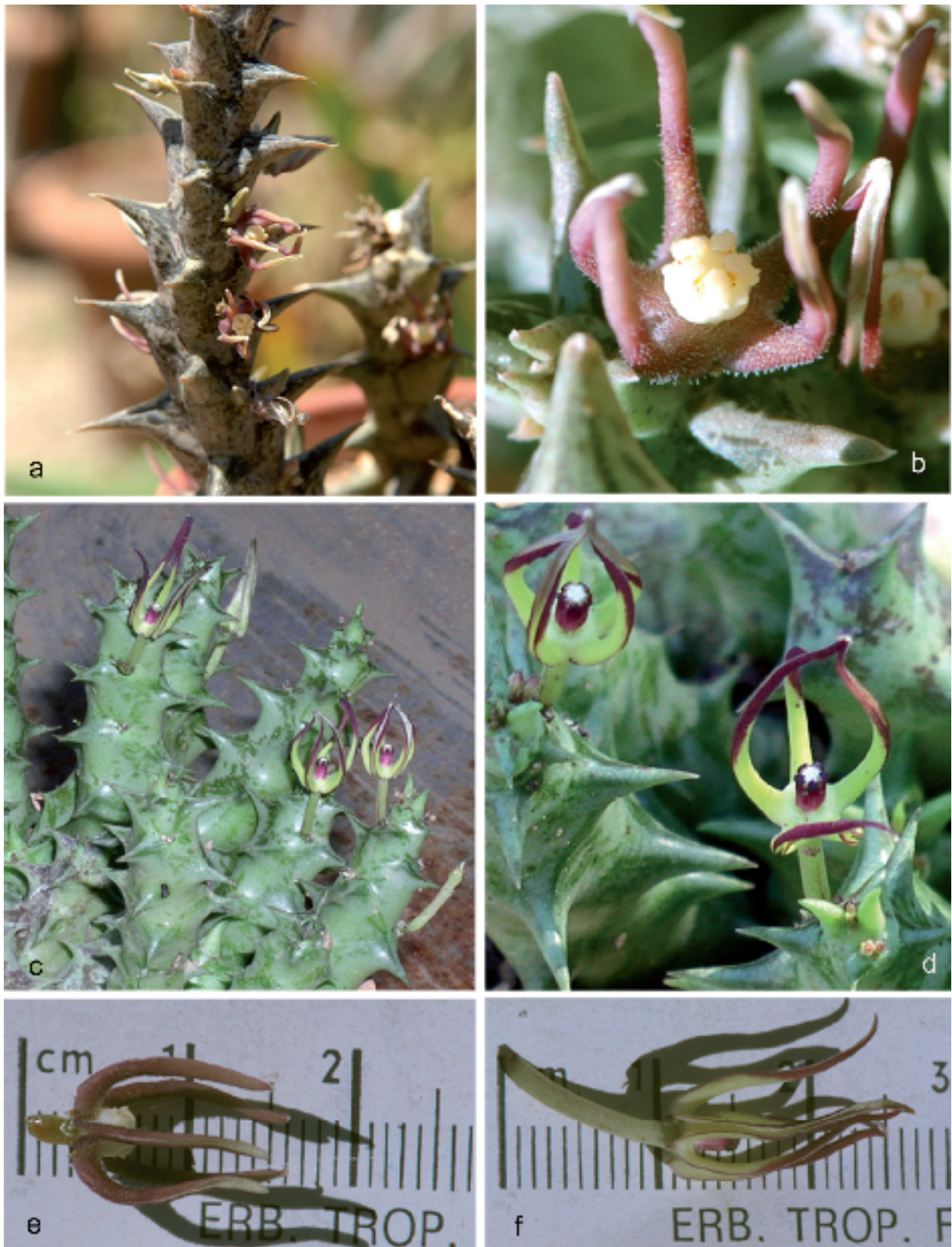
Fig. 1 - Orbea nardii : a) flowered stem (x 1); b) flower (x 4) - Orbea luntii : c) flowered stems (x 1); d) flowers (x 2,8) - Length of pedicel and corolla lobes in: e) Orbea nardii , f) Orbea luntii .