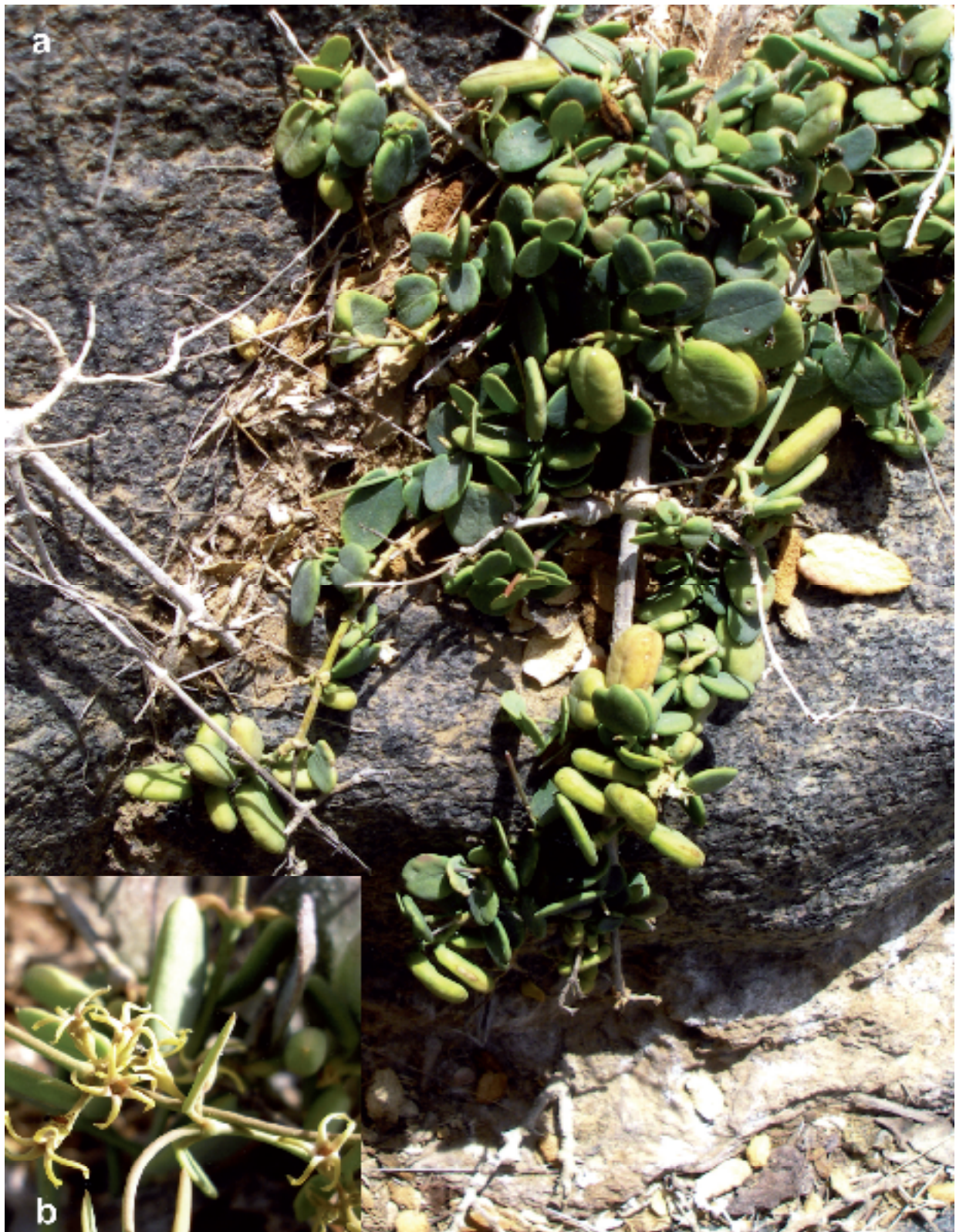
Fig. 3 - Pentatropis bentii : a) whole plant (x 0,7); b) flowers (x 1,3).