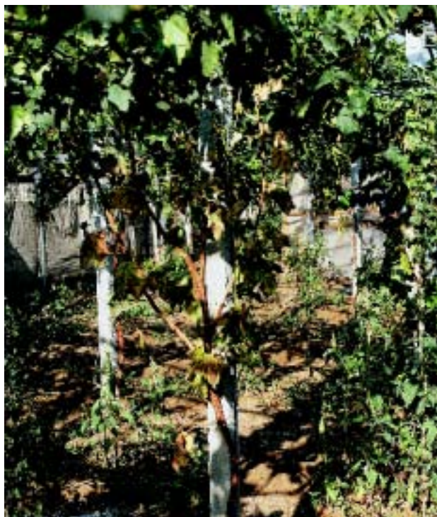
Fig. 1. Smaller leaves, chlorosis and necrosis at the margin of the leaves in declining vines heavily colonized by Phaeoacremonium chlamydosporum (cv. Victoria/775 Paulsen).