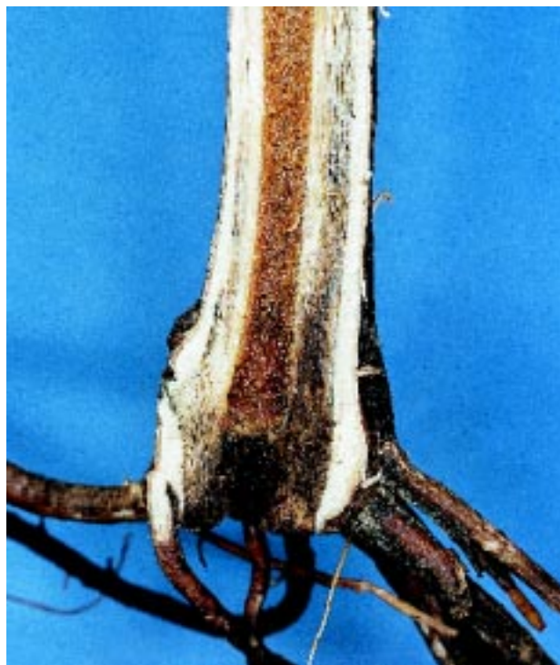
Fig. 2. Discoloured xylem in the wood at the base of a 2-year-old grapevine of the cultivar Victoria/775 Paulsen. From the darkened tissue P. chlamydosporum was frequently isolated.

In some cases the root-vessels also had brown streaking.