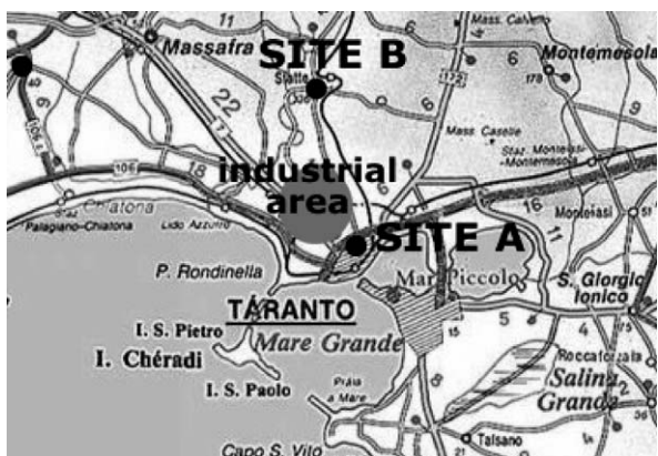
Fig. 1. Taranto map, showing the location of the industrial area and of the sampling sites.

tion of pollution dispersion models could assess the relationships between the emissions and the impact of pollution. Here we will discuss preliminary results concerning the aerosol samples we analysed by PIXE.