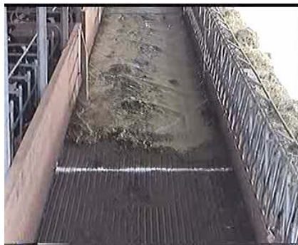
Figure 2. Flush wave on the feeding alley with manure present

Figure 2 and 3 show the flush wave on the feeding alley respectively with and without the manure presence. The pictures depict different characteristics in the regularity of the moving flux on the surface, the advancing front results disturbed by the presence of manure on the floor.