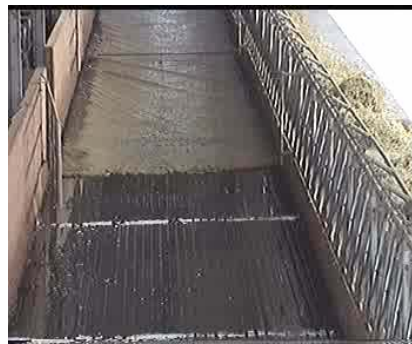
Figure 3. Flush wave on the feeding alley without manure present