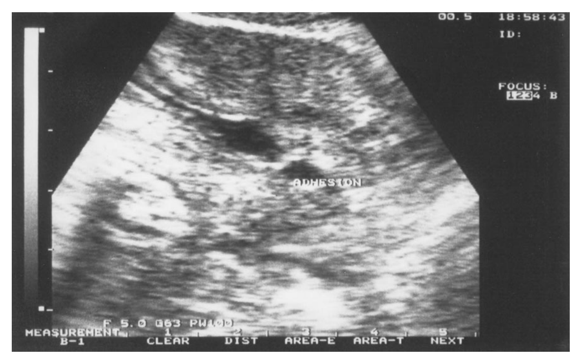
Coccia. PLUG and treatment of IUA. Fertil Steril 2001.

Longitudinal section of the uterus during saline injection at the beginning of the procedure. The uterine cavity appears as an anechoic area and a hyperechogenic band is clearly seen crossing the cavity. Figure 1