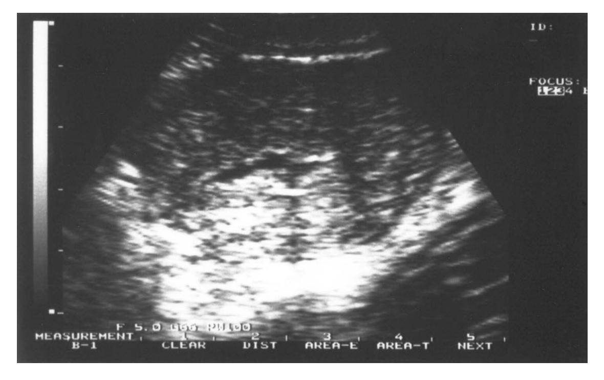
Coccia. PLUG and treatment of IUA. Fertil Steril 2001.

Transverse section of the uterus at the end of the procedure. The uterine cavity appears as an anechoic area with regular contours. The hyperechogenic band clearly visible in Figure 1 is not present.