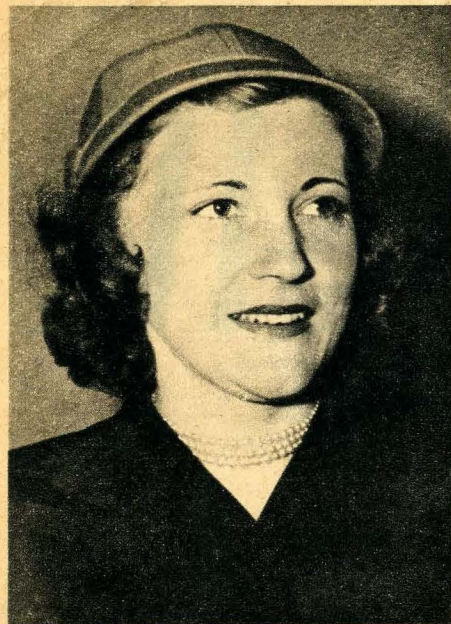
On the last day of her life Marilyn Sheppard typed a medical paper for Dr. Sam and went shopping to pick up supplies for a picnic with some of their friends.