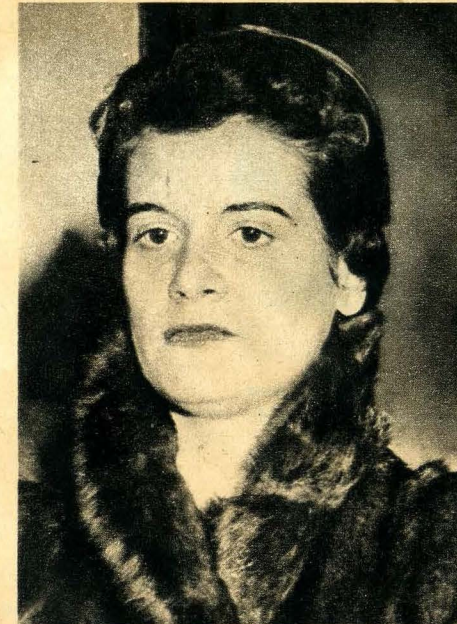
Susan Hayes was no mystery to Marilyn Sheppard, who knew that Dr. Sam had been making love to the young woman in California and even in Bay Village.