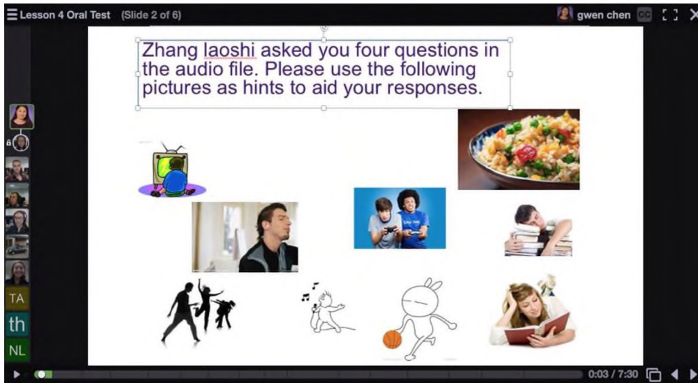
Figure 2. VT Tasks Requiring Students' Responses at the Individual Sentence Level