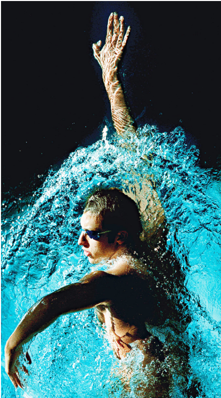
Fig. 3 - Ian Thorpe, Macquarie University alumnus and Australian Olympian. Image from the Sporting Hall of Fame Museum. Photo: Fairfax Publications © Campus Experience

In late 2012 Macquarie at the Olympics was opened. This exhibition celebrated the achievements of Macquarie University athletes who have competed at the Olympic Games. The museum identified strong university links to the Olympic and Paralympic Games dating back to Montreal in 1976. Seventeen Olympians, including staff, alumni and students have competed. The exhibition was created to celebrate an Olympic year. It also recognised that Macquarie Olympians have embraced the broad Olympic spirit of goodwill, unity, reconciliation and peace in their pursuit of sporting excellence that has captured the public's imagination. The exhibition featured a display cabinet with each athlete's special Olympic memorabilia. 10 This topic was one of the forward exhibition concepts presented to the committee in 2008, during the Beijing Olympics, before the launch of the museum.