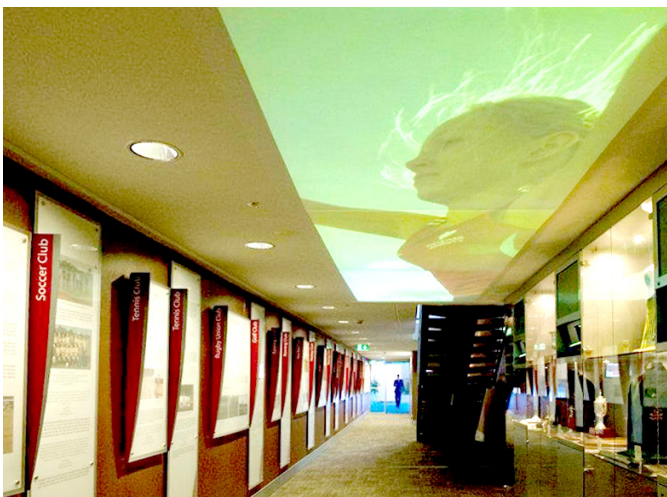
Fig. 2 - Museum space showing objects in show cases on right, story boards and text panels on left and video projection on roof.

selection of high profile sporting participants. This helped to extend connections with previous sporting alumni encouraging donation of more objects to build the museum's collection. The athletes in the first exhibition had achieved success in swimming, rowing, athletics, softball, ultimate frisbee and wheelchair basketball. A rowing coach was also featured. The launch was attended by friends and family of those featured in the exhibition. One of the technical highlights of the museum was the development of a ceiling projector showing video footage which gives visitors a feeling of immersion in the subject. The focus on individual stories reinforces the importance of people in the work of the museum.