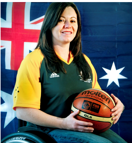
Fig. 4 - Tina McKenzie, Macquarie University alumna and Australian Paralympian.

For this reason we propose that the Macquarie University Sporting Hall of Fame Museum represents a distinct type of