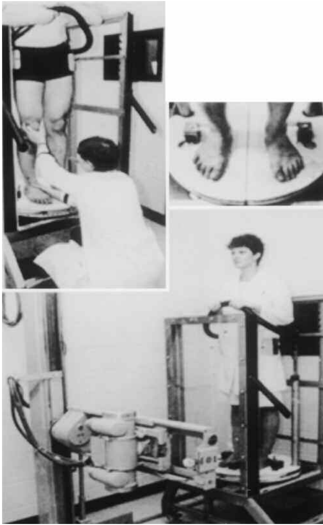
Figure 2. A standardized imaging frame and the set-up used to obtain reliable limb positioning. The technologist is shown evaluating the direction of the knee flexion plane.

controlling positional errors may be successfully adapted to other radiographic configurations to yield a reduction of positional errors.