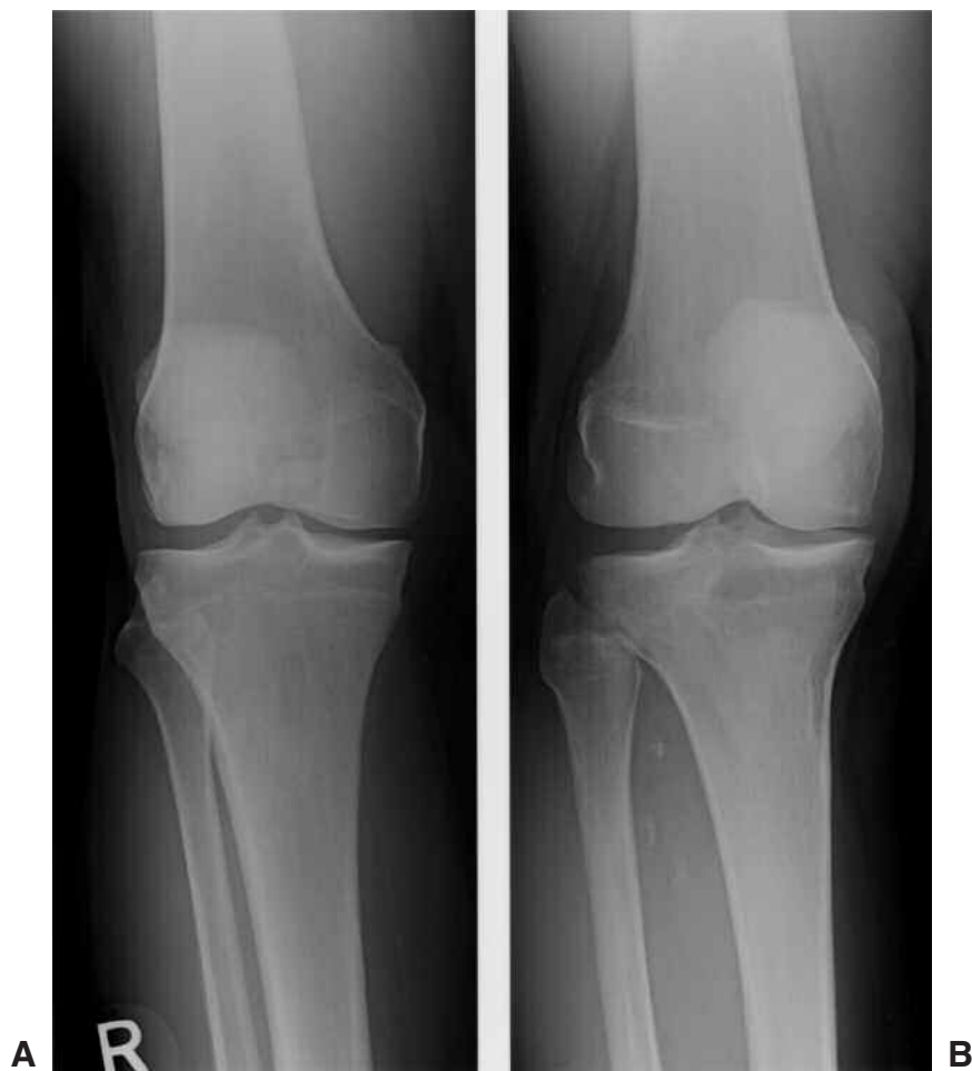
Figure 5. A. In this view the same knee (Figure 4) has been repositioned in the frame with a small degree of external rotation. Note the prominence of the medial femoral condyle and the asymmetry of the intercondylar notch. The patella is seen more lateral to the midline. Note narrowing of the tibiofibular interval with more overlap of the proximal tibiofibular joint. B. The same knee viewed from the front, but repositioned with some internal rotation. Note the more medially disposed patella, the greater prominence of the lateral femoral condyle, the asymmetry of the intercondylar notch, and the widened tibiofibular interval.