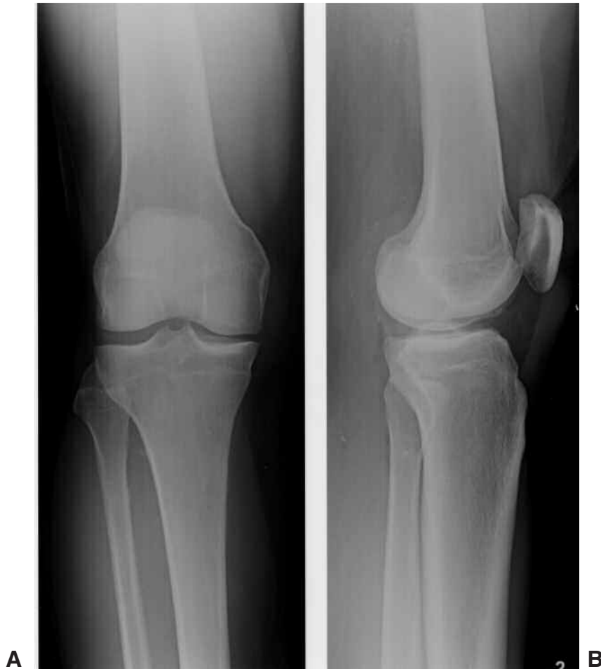
Figure 4. A. Anterior-posterior standing view of a knee with mild medial compartment osteoarthritis. Note the condylar symmetry of the femoral condylar projections and the intercondylar notch. A distinct tibiofibular interval is present, with slight overlap of the proximal tibiofibular joint. B. The same knee viewed standing from the 90° lateral perspective. Note the asymmetry of the femoral condylar projections, with the medial surface being more distal and posterior. Note the slim tibiofibular gap.

(at least directly), which is a limitation that becomes serious in the presence of many limb deformities. Long views overcome these limitations, providing locations for the hip, knee, and ankle centers from which the limb mechanical axes, along with the orientations of the knee's articulating surfaces, may be computed.