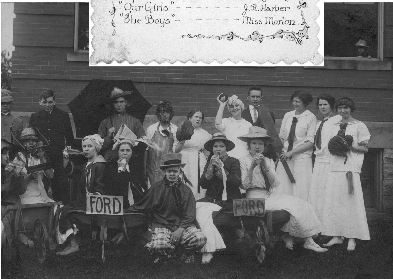
Candid photo of students, 1915