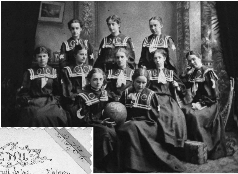
Women's basketball team, 1890s