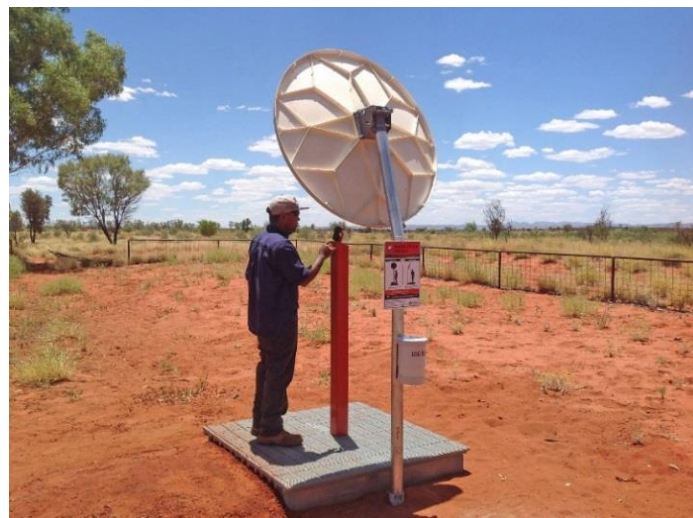
Figure 2: Mobile Phone Hotspot

The CAT mobile phone hotspot was designed for Australia (see Figure 2) but a potential project could be to investigate types of antennas and hardware configurations that could be used in remote areas of South America and other locations to amplify cell phone signals. In the Vacas area in Bolivia, there can be limited cell phone