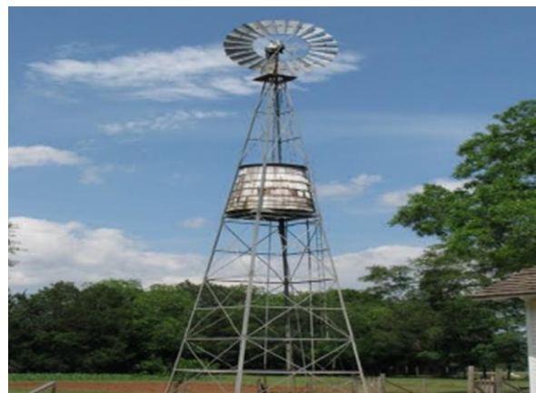
Figure 1: Hydro-Aero Power [14]

Another power generation option with potential is micro hydro-electric power. An excellent survey on this topic and the innovative technologies being considered for rural Africa is given by Kusakana [14]. Micro hydro-electric power is considered a very viable option in Africa and other areas such as Canada that has many rural residents. Designing a micro hydro-power system for a specific area needs to consider the penstock, turbine, generator, and electrical storage options [14]. One creative solution that includes hydro-electric power is hydro-aero power, which includes a windmill, water storage, and power generation as shown in Figure 1. The windmill powers a pump to draw water up to the storage tank where it can be used for drinking water or drains through a pipe to operate an electricity generator. This solution is finding success in Africa since many of the farmers already have a windmill. Various designs