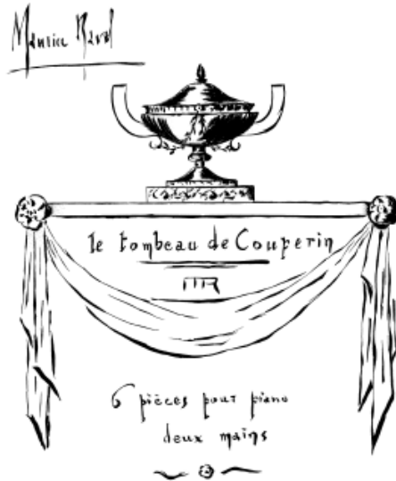
Fig. 1. Cover of the first printed edition illustrated by Ravel 25

The illustration in Fig. 1 shows a baroque urn-shaped vase on a raised pedestal. Flowing drapery and a small branch of laurel complete the picture. Under the words of the title, Le tombeau de Couperin , Ravel's familiar monogram, his initials written in block-letters which run together, is placed prominently right above the drapery. The laurel used in this drawing is an evergreen tree or shrub once used by ancient Greeks to award the victors in the Olympic games. It was a form of honor, recognition of achievement. The laurel in this illustration may have been a way to honor himself as a composer rather than receiving tribute through the decoration he had previously rejected while it also gave honor to his wartime friends and early French composers.