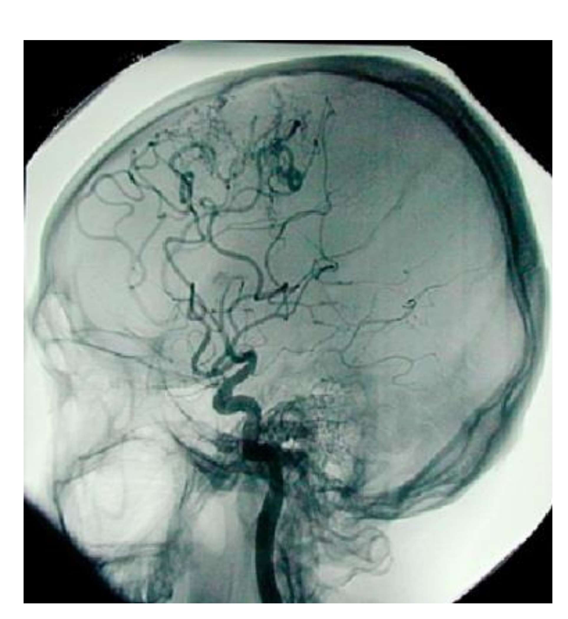
Figure I: Angiogram of blood supply to a live brain