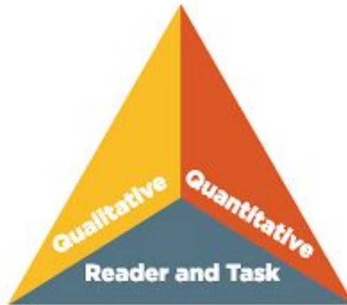
Figure 1. The Standards' Model of Text Complexity.

Engagement with texts. Another important aspect that teachers need to keep in mind when selecting texts for their curriculum is students' engagement with the text. Rosenblatt (1967/2005), a theorist known for her studies regarding readers and their responses to literature, asserts that "...the teaching of reading and writing at any developmental level should have as its first concern the creation of environments and activities in which students are motivated and encouraged to draw on their own resources to make 'live' meanings" (p. 27). Rosenblatt's (1967/2005) assertion opens up a discussion on the value of students' level of engagement with texts, a conversation that is still continuing today.