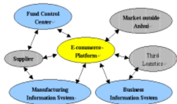
Fig.2 Framework of ATC information System

The basic idea of constructing ATC's e-commerce system is to achieve standardization through information system and build up a scientific management system. The system is centered by e-business, including e-commerce platform, centralized fund management system, ERP for manufacturing factories and MIS for sales firms. The