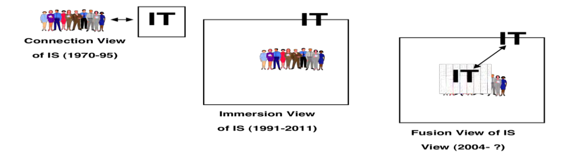
Figure 1 The Connection, Immersion and Fusion views of IS (El Sawy, 2003)

where work and IT-processes are so intertwined, that IT cannot be pushed aside for human work to continue. People are connected to the business environment via IT so much that to operate effectively they need to change the way they work as individuals, groups, enterprise or even across enterprises. This often means that business processes need to be changed too, in order to take the full advantage of IT.