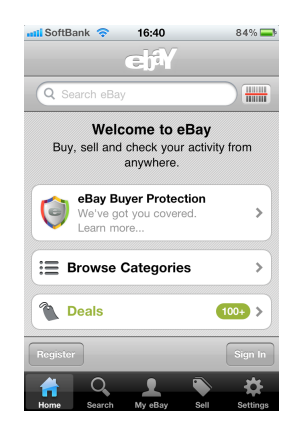
Fig. 6 eBay Mobile user interface (on iPhone)

eBay Mobile. It is 3.5 stars voted (on July 25, 2011). It is fixed portrait interface, shown in English. At home page, the upper part has search box and barcode function; the middle area contains eBay Buyer Protection, Browse categories, Deals Register button, and Sign In button; the bottom menu bar consists of Home, Search, My eBay, Sell, and Setting. In the product page, there are product name, zoom-able photos, description, time left (for auction), buy it now price, condition, location, shipping fee, ship-to location, Buy It Now button, Payment