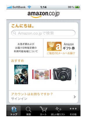
Fig. 2 Amazon JP user interface (on iPhone)