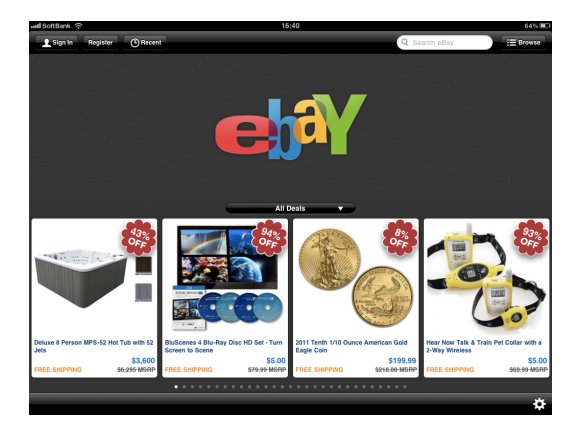
Fig. 5 eBay for iPad user interface (on iPad)

eBay for iPad. It is 3 stars voted (on July 25, 2011). It is rotatable to both portrait and landscape seamlessly. The interface is shown in English. It is different from the previous applications for the home page, which provides eBay Deals in the format of only one row in landscape and two rows in portrait. The users can view and scroll independently each row. After browsing into category and sub-category, the catalog shows on screen, initially, sorted by best match.