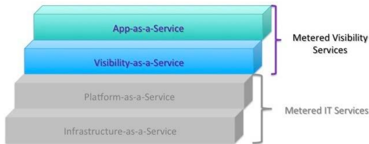
Figure 2. The Visibility Cloud (VC) Service Stack

Figure 2 illustrates the two new services in a cloud computing model for the VC. The infrastructure and platform environment are also known based on the runtime parameters, such as computing power, storage requirement and memory size support.