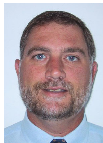
Computing, and Journal of Accounting Education.

and Information Systems at Virginia Polytechnic and State University and has published articles in Journal of Computer Information System, Journal of End User