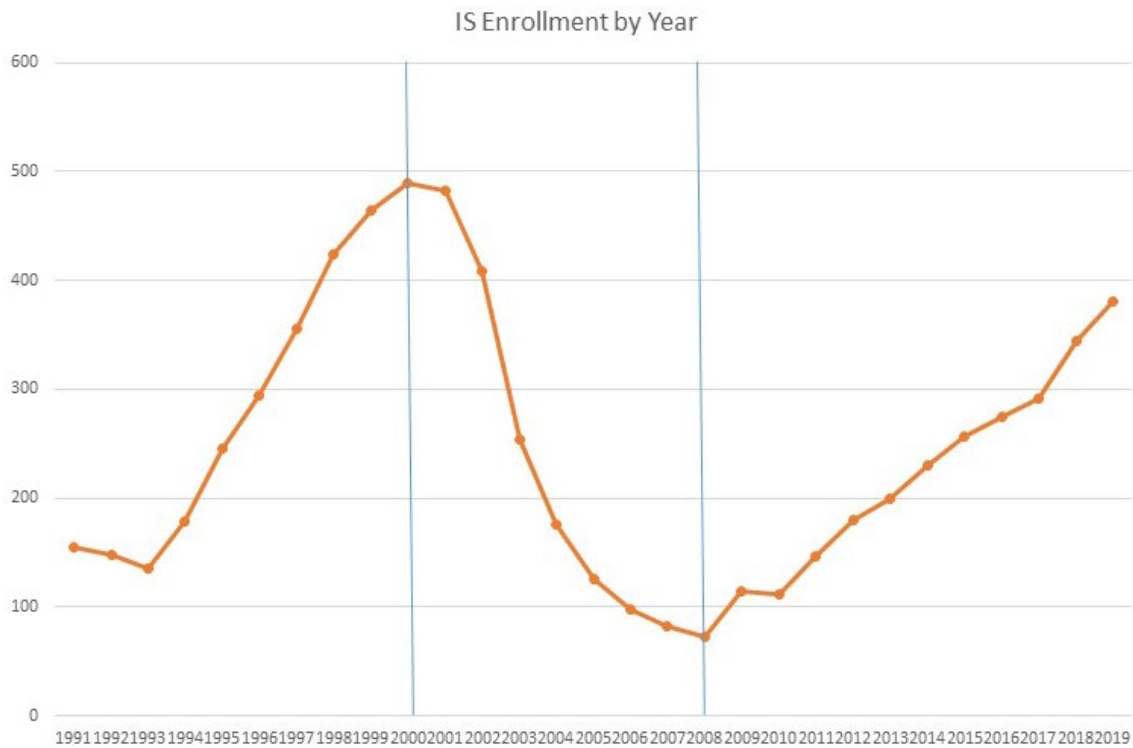
Figure 1. Three of the Four Eras of Academic IS History, Illustrated with MIS Majors Data

(Note: Real data collected from two similarly sized MIS programs at large, public universities. Each point represents the number of MIS majors in the program for that year. Double majors are not counted. Data from 1991 through 2010 are from one university; data from 2012 through 2019 are from the second university. Data from 2011 were missing and were extrapolated.)