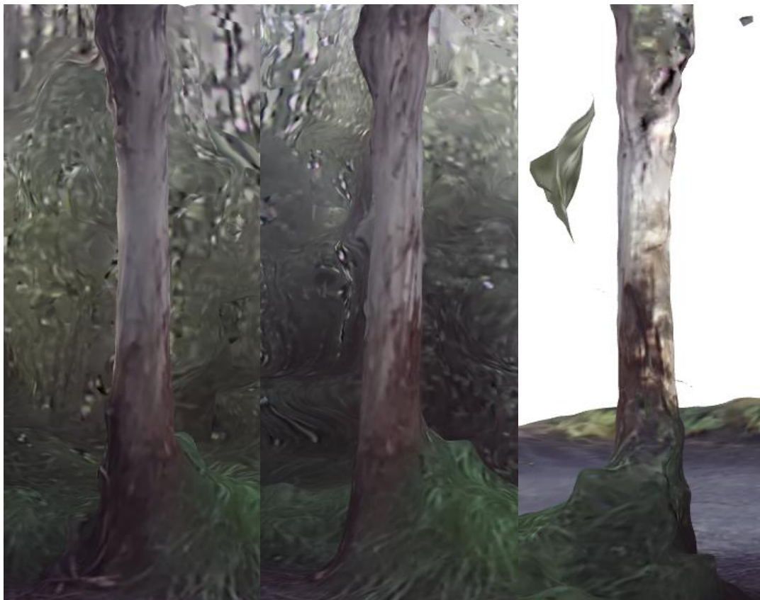
Figure 2 the three image views of a eucalyptus nitens taken by a 3D stereo camera mounted on a drone

More broadly, the research program of this theme will continue to innovative and anticipates delivering even more tangible value to industry partners over the next 12-24 months.