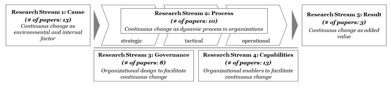
Figure 1. Continuous Change Research Streams

From our set of eligible papers, we identified five major research streams which explore continuous change from different perspectives. First, continuous change in external and internal conditions requiring adequate responses of organizations. Second, the process of continuous change which occurs within organizations. The next two streams are the necessary organizational governance and capabilities which facilitate continuous change. The last research stream considers the outcome of continuous change. Figure 1 shows the links between the research streams, including the number of papers with findings for the respective research stream. Note that the numbers of papers per research stream are not disjoint sets since a paper can provide findings for several research streams. In the following, we elucidate the identified research streams in more detail.