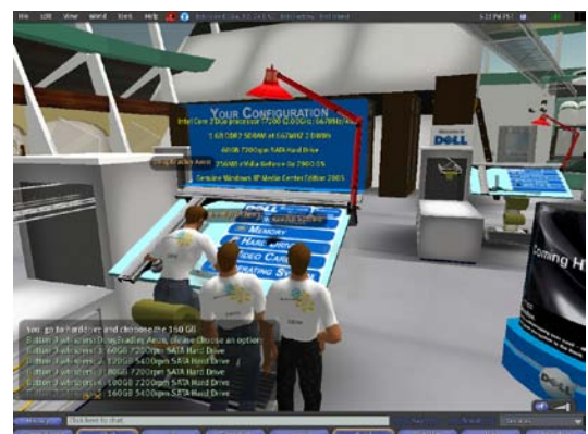
Figure 2-2 Student Teams Working on Computer Configuration Tasks on Dell Island