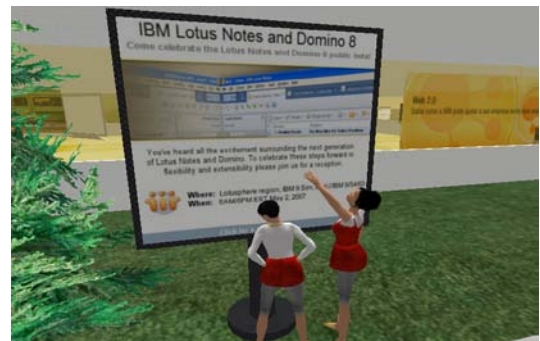
Figure 2-1 Student Teams Working on Learning Tasks on IBM Island

The online survey collects responses to items measuring the PEOU, PU, and BI, which were adapted from Davis (1989). The CP, CSC, and CA items were adapted from Venkatesh (2000). All items were measured on a seven-point scale ranging from strongly disagree (1) to strongly agree (7). The questionnaire also collected user information such as demographics, current use of social networking sites, and previous knowledge of Second Life. The main survey items were listed in Table 3.