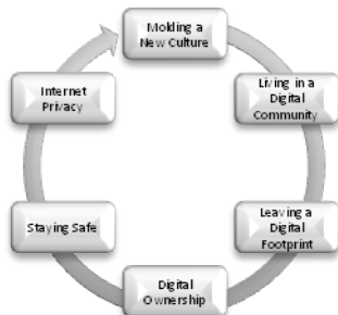
Figure 2: Topics for Living in a Digital World

In the "Molding a New Culture" articles, we painted a picture of our current culture, the technological tools students are apt to use, and students' preferences with these tools. For instance, students prefer IM to Email but they still prefer to spend time with each other in physical space rather than virtual space (Lenhart, Madden, & Hitlin, 2005). Students learn that in the past, we could maintain about 150 stable relationships (Robin Dunbar, 2008). But, with the Internet we can substantially increase this number.