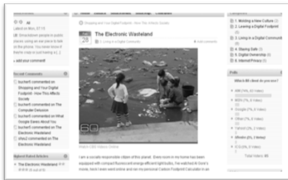
Figure 1: The Electronic Wasteland

2.2.1 Example Screen: Figure 1 provides an example of the site we created. The page that you see is the beginning of the highest rated article/video that is available at this time. Our vision and the Web 2.0 technology that we employed allowed us to present students with multimedia-enhanced content coupled with commentary and discussion of some of the problems and opportunities we create through the advancement of technology. Visualization is a powerful learning mechanism and, paired with peer reactions, ratings, and polls, it allows our students to learn about our world in a compelling manner. More will be discussed about the site in section 4. For now, we will continue the discussion about the project team and their responsibilities, the structure of the course, the subject matter that we focused on, and the Web format that we employed.