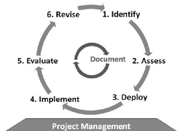
Figure 3: A Replicable Experiential Learning Cycle for Information Technology Students

The cycle repeats as students and instructor in the current or successive semesters identify newly emerging technology areas (“Identify” step), such as Mobile-Commerce, Location Aware Services, and other still-maturing technologies. Given the rapid pace of change in hosted services, knowledge will naturally evolve over successive semesters as service providers improve their offerings.