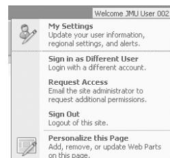
Figure 1. Settings Menu