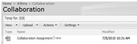
Figure 6. Document Library with One Word Document

To encourage use of feedback and iteration, each student is required to make multiple postings, one of which must be in the form of feedback. In addition, students are required to be active on their SharePoint site at least three different days of the assignment period. The content of the answers is not heavily graded; students are evaluated individually on their effort to collaborate in developing those answers.