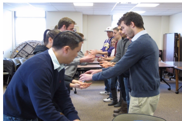
Figure 2: The Ball Game in Action

Figure 2 illustrates the ball game in action with actual students. To begin the exercise, the class is divided into teams of six to twelve students. Each team is then given a bag that contains 20-30 hand-sized balls. The teams are then told that their goal is to deliver a maximum number of balls within a 2-minute period (Potentially Shippable Product). In order for a ball to count, it must be touched by every team member; it must spend some time airborne between touches; and when passed, it must not be passed between team members who are next to each other. If all of the balls have been used within the 2 minute time period (Sprint), the team may recycle balls and add to their total. The team is also responsible for an accurate count of balls actually delivered. At the conclusion of this explanation, the team is given two minutes to create their process and provide an estimate of how many balls they think they can deliver in a two-minute work timebox (Sprint Planning). When the two minute planning timebox expires, the work timebox begins. At the end of the work timebox, the team provides a count of their processed balls. The two-minute process creating and refining/two minute working cycle continues for five iterations.