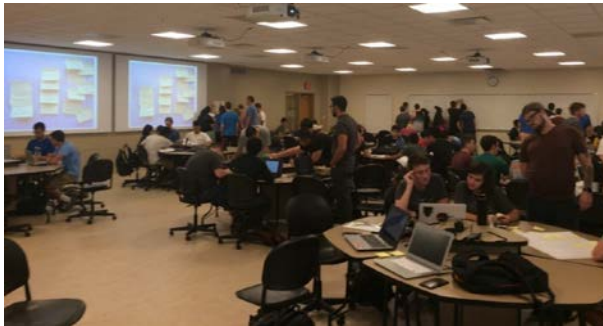
Figure 2. Students Generating a Product Backlog for their Projects