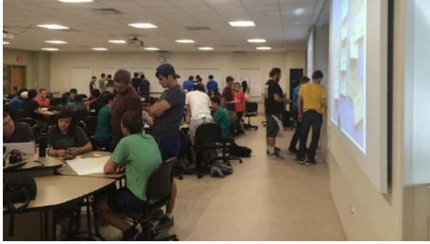
Figure 1. Students Brainstorming Requirements for their Design Project