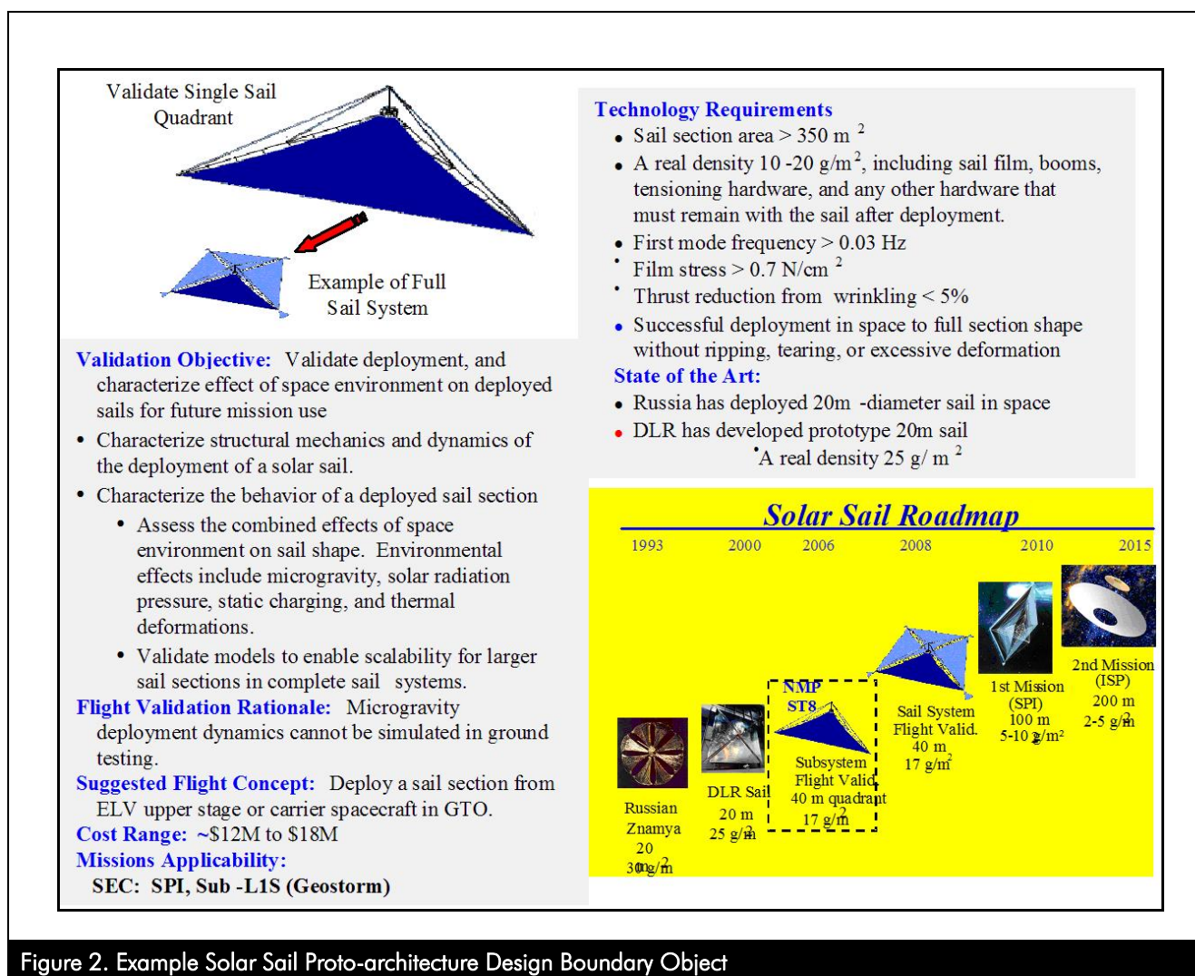
Figure 2. Example Solar Sail Proto-architecture Design Boundary Object

Each design candidate was modeled as a proto-architecture to establish an initial proof of design concept. The NMP staff used the term ‘concept’ to mean a design project or idea. Each concept was represented by a ‘quad-chart’. One NMP technologist expressed this as follows: “We create a quad-chart for every concept. It has all of the information we need on one page. It has taken us 8 years to get them right.”