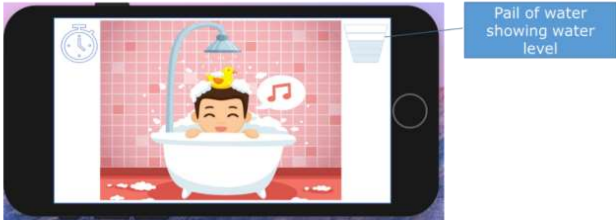
Fig 2: Practise Scenario of the Save H 2 O Game