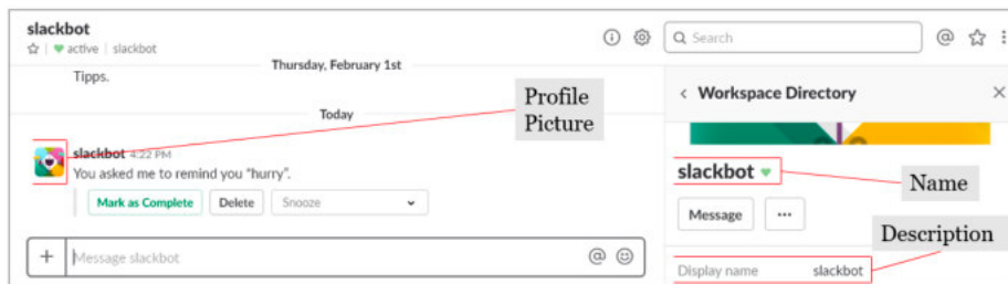
Figure 2: Picture and Name of Chatbot as Example of Anthropomorphic Design Feature