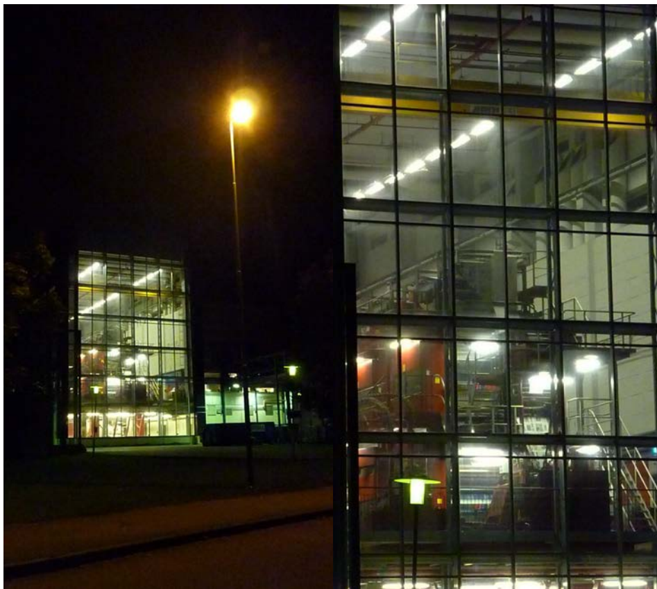
Figure 2. The NWT Printing Press

Thus, it would seem that NWT has a deliberate strategy with the design aesthetic not only for visitors and for representational purposes, but also for their own employees. Furthermore, this is an aesthetic that expands for each local newspaper the corporate group has acquired. As NWT acquired small newspapers, it renovated the interior and put in the same type of ship-wood floor and contributed art in order to “boost morale and increase identification” (UM #3) with NWT’s corporate culture. The “image” of the corporation was in each instance constituted and territorialized using selected materials for flooring and the presence of art. What is being territorialized in each instance is a sense of belonging and of being part of something successful and longstanding. This philosophy is evident at NWT’s headquarters via the nostalgic centrality given to the old printing industry and the manual craft of printing. Antique printing equipment is put on display, and a scale model of the current printing press adorns the middle of the lobby next to a scale model of the building. A significant part of the guided tour was devoted to visiting the printing press, yet new information technology sections such as the Web department was not visited at all.