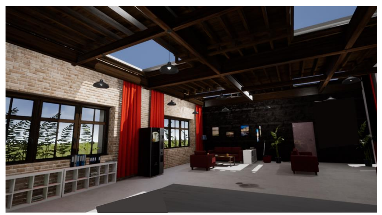
Figure 4. Virtual reality learning environment