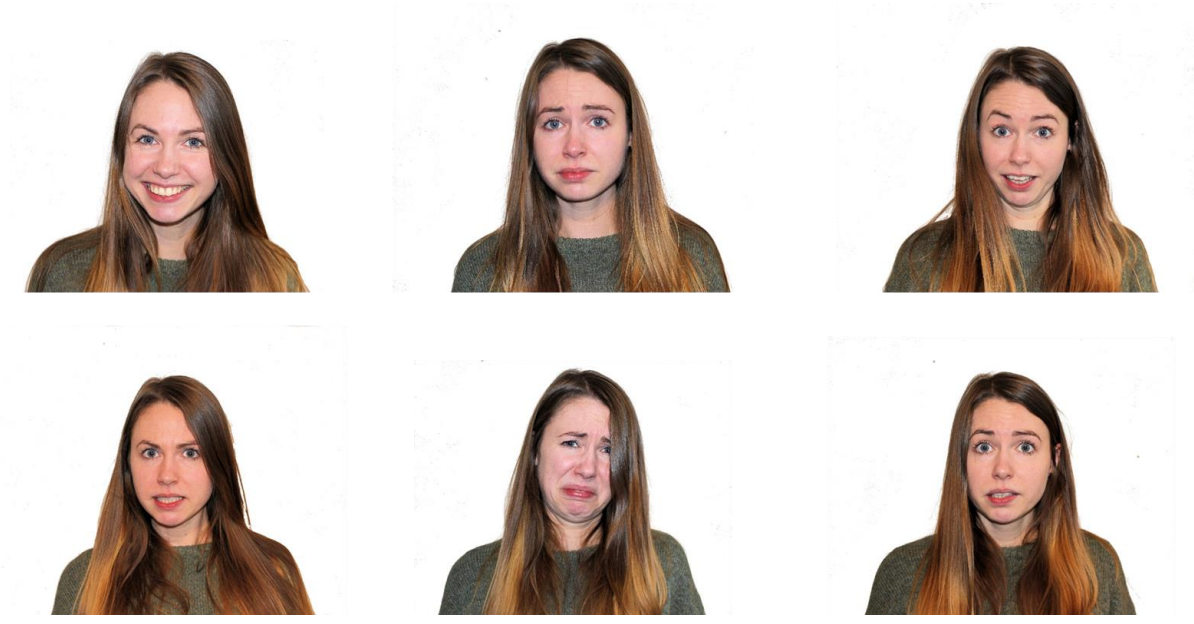
Figure 2. Virtual emotion cards (From top left to bottom right: happiness, sadness, surprise, anger, disgust and fear)