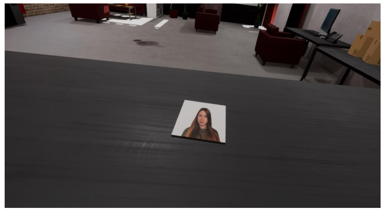
Figure 3. Virtual emotion card within the virtual learning scenario

In relation to a system related bug (which makes the system stop working) and feedback about the virtual scenario (conversational interview during and after the VR session), we decided to have two sessions with each participant because the bug caused a high distraction and we adjusted some detail elements into the virtual setting. Hence, for the second session, we fixed the problem with the bug and added details such as the color of the ceiling and a landscape behind the virtual window to make the autistics feel more comfortable in the virtual learning environment (c.f. Figure 4). After finishing all session, all autistics, the researchers and the therapist from the autism therapy-center come together to have a final feedback round and to give all children the opportunity to exchange views.