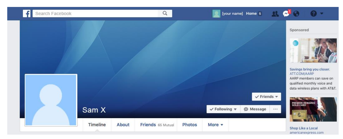
Figure 4. Facebook homepage mockup showing the number of mutual friends.

Consistent with the original study, the information dissemination manipulation was assessed by including three True/False items that asked the participant if she was aware that she had been tagged on the post or not. Twenty-four participants failed to identify whether they were tagged on the post and were dropped from the subsequent analysis. The network commonality manipulation check in the original paper was implemented by asking participants to rate how much their network overlapped with that of the presumed disseminator via a four-item scale. As in the original study, we used the same manipulation check items and we calculated the mean responses to verify the effect of the manipulations.